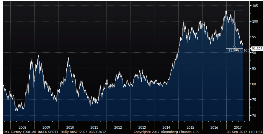
CHART 1: Dollar Index Spot

For Index descriptors, see "Index Descriptions" at end of document.