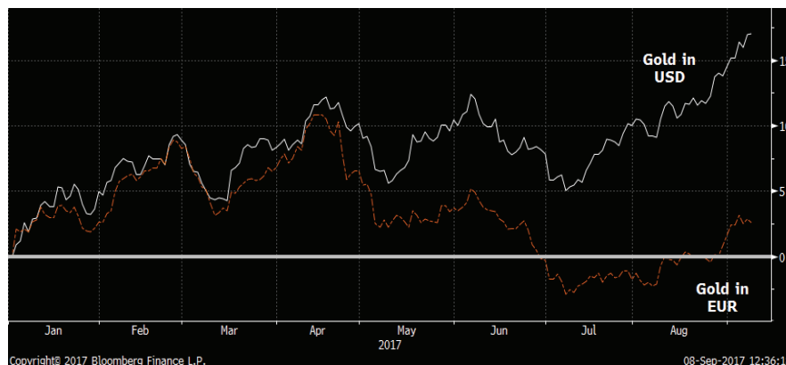
CHART 6: Gold

For Index descriptors, see "Index Descriptions" at end of document.