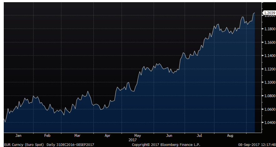
CHART 4: Euro - USD Spot

For Index descriptors, see "Index Descriptions" at end of document.