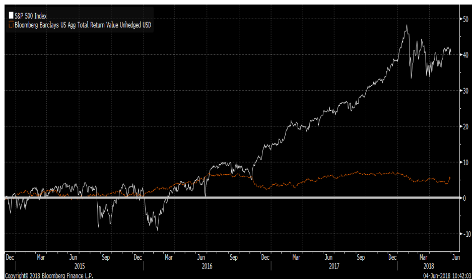
CHART 1: S&P 500® vs. Bloomberg Barclays US Bond Aggregate Nov 30, 2014 – May 31, 2018

For Index descriptors, see "Index Descriptions" at end of document.