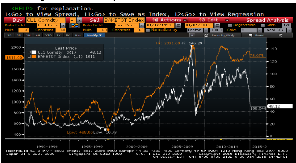
Chart 1: Rig count versus WTI price

2015 could be a year during which Greece is less risky than investors currently believe, but Grease could be even riskier. We remain positioned accordingly.